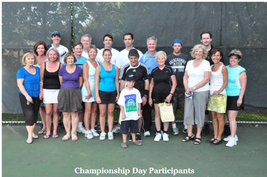
Championship Day Participants